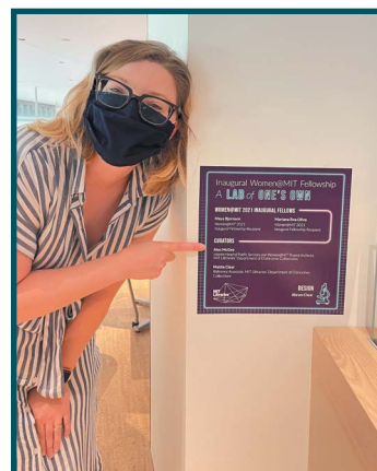
Above: A Lab of One's Own Women@MIT Fellowship

Take the classes. Be open to the possibilities. I didn't know what I was going to do with my degrees, but I knew I was passionate about what I was studying and tried to be open to the opportunities out there. Experience and meeting people in the field helps get your foot in the door. These fields can be exploitative and are guilty of devaluing the labor behind this work as the field is increasingly feminized, but there are many, myself included, that are pushing our profession to do better. While we need contingent labor, be it students, interns, or temp or term positions, we can structure them to be more fair and transparent and make the experience still beneficial for you to grow.