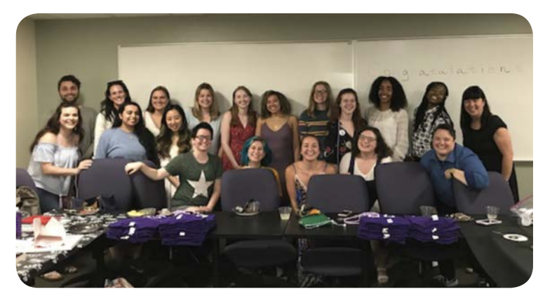
Above: Women's Studies Class of 2019 - Congratulations!

and Transcending the Gender Binary: A Discussion" were published in The Classic , the Writing Intensive Program's journal of undergraduate writing and research.